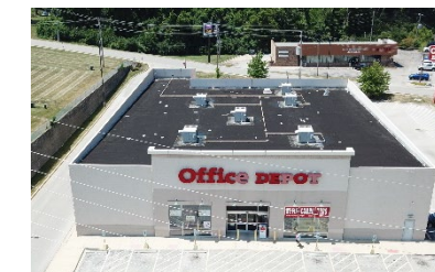
303 Alton Square Dr at IL-3 Alton, IL