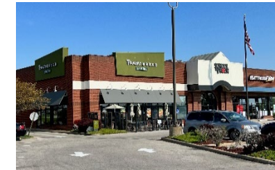
280 Mid Rivers Mall Circle St. Peters, MO