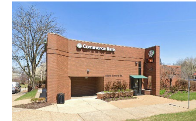
6369 Clayton Rd Clayton, MO