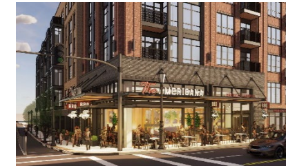
The Shoppes at Central Ave Clayton, MO 63105