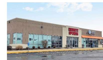
1555 Vaughn Rd Wood River, IL 62095