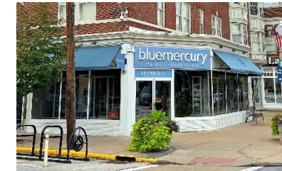
2 Maryland Plaza St. Louis, MO 63108