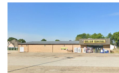
1215 W. Garfield Ave Bartonville, IL 61607